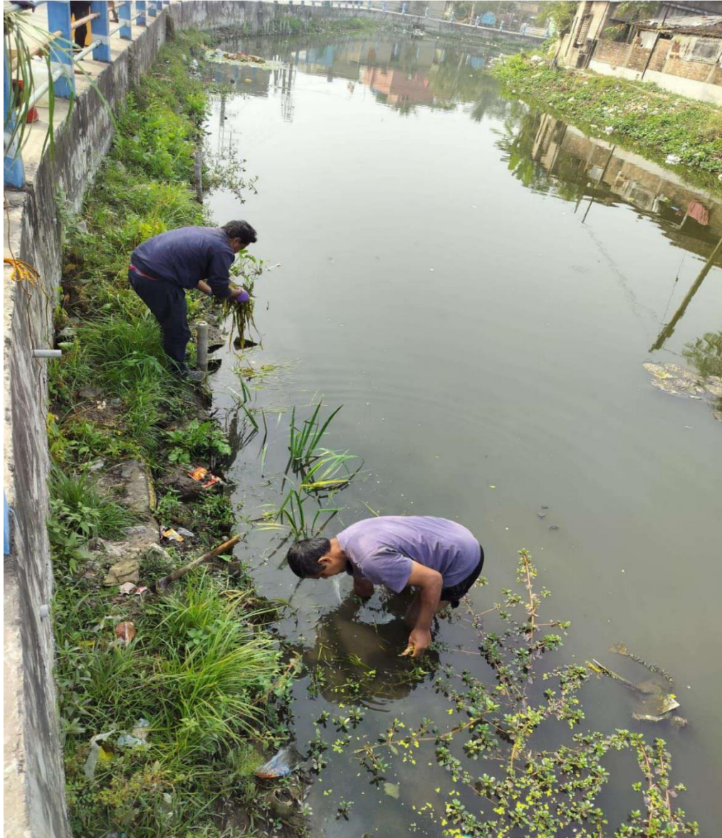
Collection of waste water from Noai-Khal