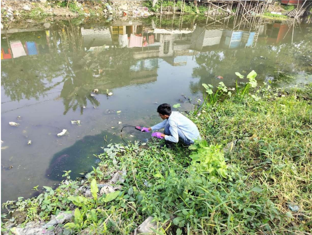
Collection of waste water from Noai-Khal